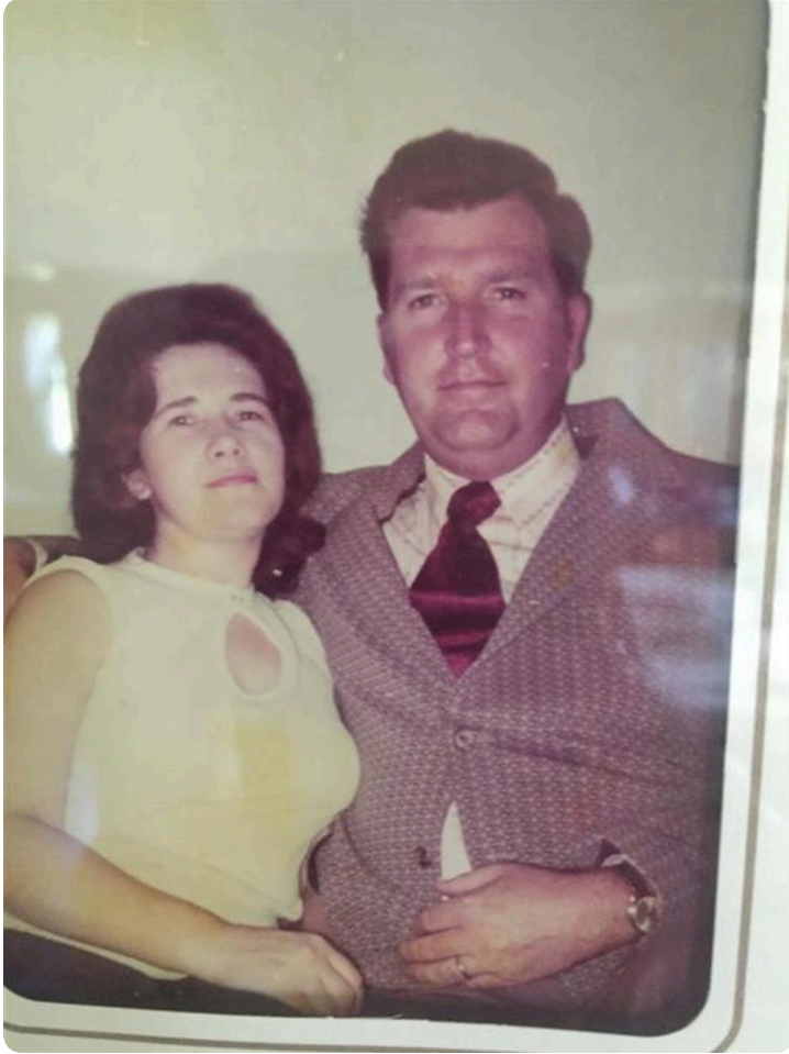
loving husband, father & grandfather